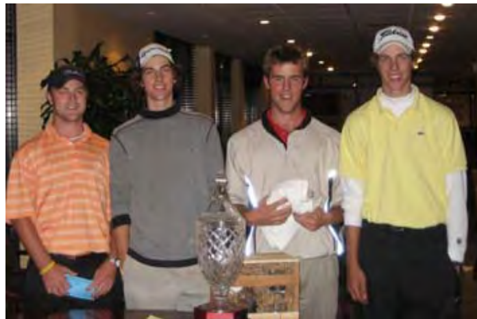
Sunday, June 24 th , 2007 at VGC – The Zone 4 BCGA Men’s Team